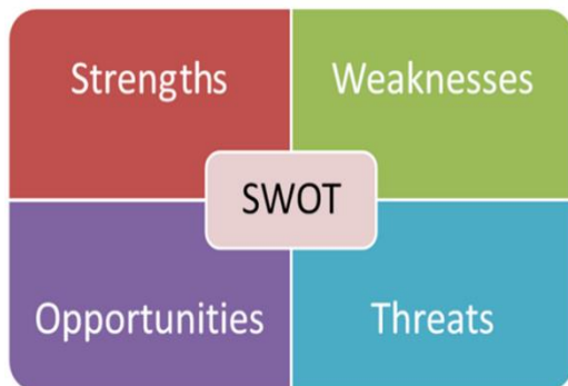
Figure 7: SWOT Analysis

A SWOT analysis is a business term utilized to identify the Strengths , Weaknesses , Opportunities , and Threats present within an agency’s operating environment. This type of analysis involves specifying the objective or mission of an organization and identifying the internal and external factors that are favorable and unfavorable to achieve that objective.