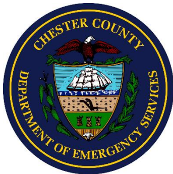
Figure 6 Chester County Department of Emergency Services Seal

The Chester County Department of Emergency Services (DES) provides support and to some degree, coordination of the fire and EMS delivery system throughout the County. Operating under the auspices of the Pennsylvania Department of Health, it also serves in an administrative oversight role as the regional EMS council. DES operates a fully interoperable 800 MHz radio system, along with mobile data computers, paging, station printers, WebCad, and third-party dispatch services from its emergency communications/ 9-1-1 Center. Chester County provides radio communication equipment and dispatch services to all the County's fire and EMS agencies at no cost.